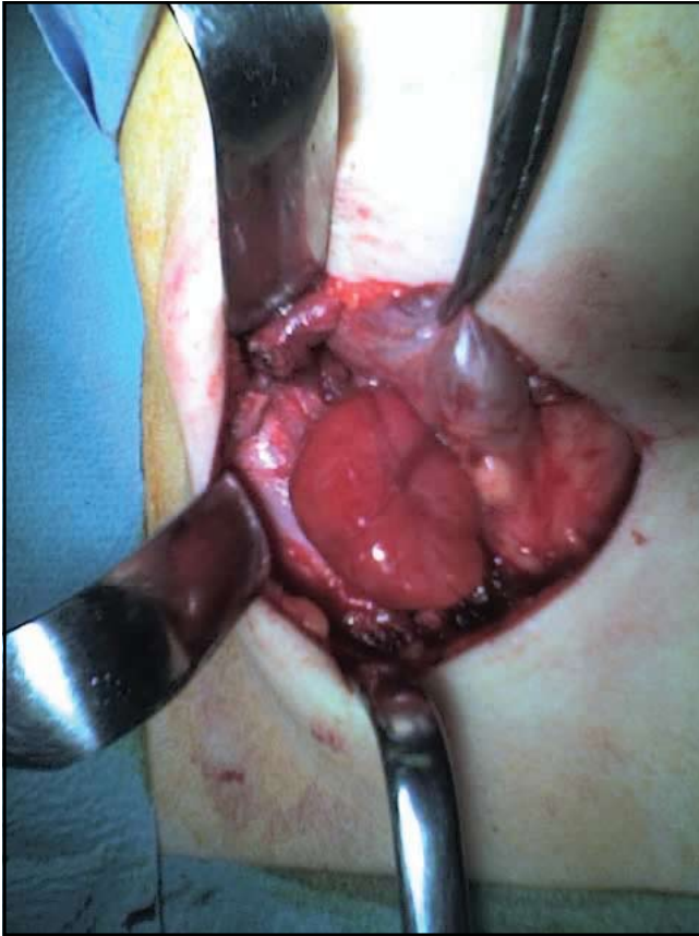
Figure 2. Large right inferior parathyroid adenoma in situ