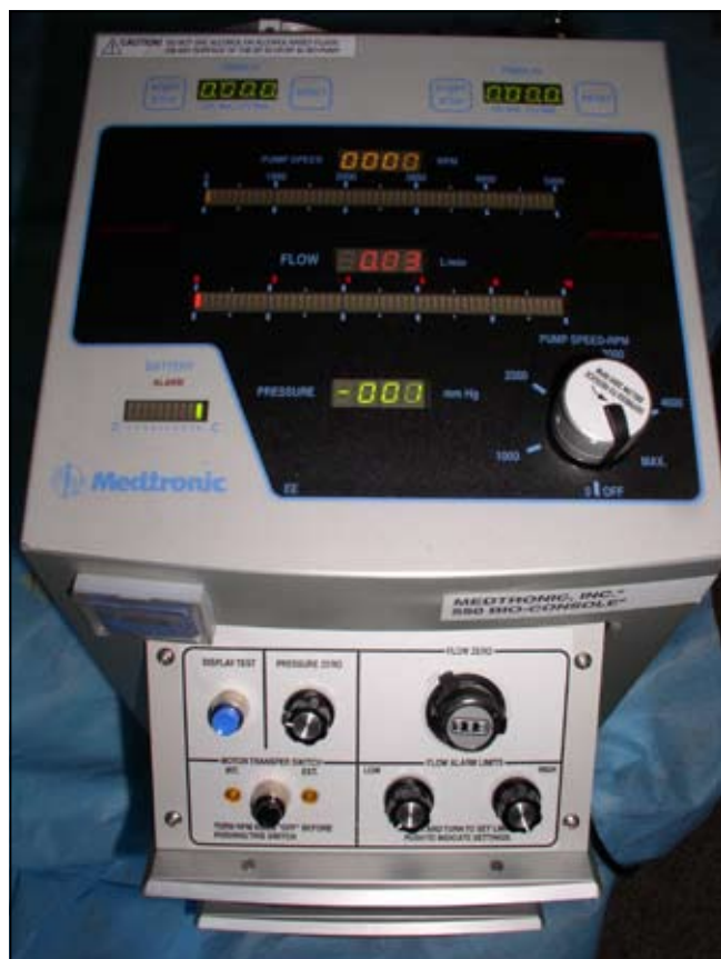
Fig 2. Photograph of the console of the Biomedicus pump (Medtronic Inc), two independent consoles controlled the Biomedicus pumps for flow and revolutions per minute.

The patient developed a coagulopathy due in part to rapid heparinisation and prolonged CPB and required substantial infusions of coagulation products. The chest was left open and packed with sterile gauze and he had repeated re-explorations over the next 24 hours to identify and correct surgical bleeding points as they became apparent.