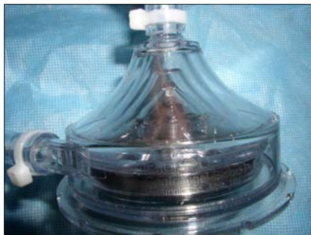
Fig 1. Photograph depicting the close up of a Biomedicus (Medtronic Inc) pump with the inlet and outlet connectors. Two pumps were used, one for the right ventricular bypass and one for the left ventricular bypass.

ventricular function (Ejection fraction 18%). His operation was deferred on initial admission due to MRSA grown from the right groin and he continued to experience chest pain on minimal exertion daily, with activity limited to bedside movements only.