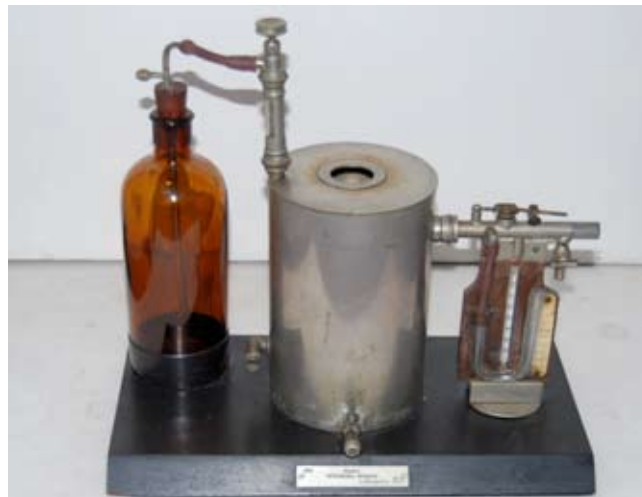
Fig 4. Magill intratracheal apparatus 1921.

Magill approached a rubber shop in Tottenham Court Road and came to an arrangement with the owner that he would be given the tail ends of the rubber tubing that was stored in coils. This continued until a bomb destroyed the shop during the Second World War. Later with the assistance of Charles King, Magill managed to get the rubber tubes manufactured to his specific specifications 4 .