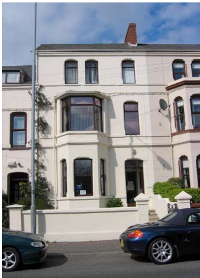
Fig 2. 10 Curran Road. (Taken 11 th April 2007).

expected to be able to give an anaesthetic for any operation. He considered his certificate gained on graduation inadequate training and claimed to be frightened of this 'onerous task' 4 .