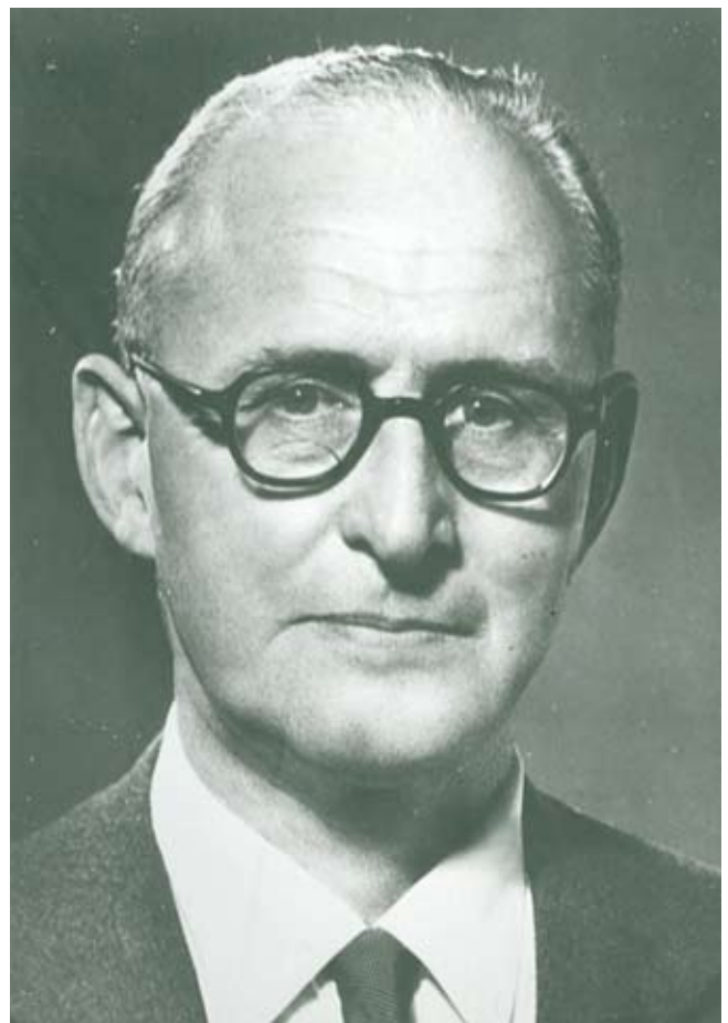
Fig 1. Ivan Magill

Upon qualifying, Magill was issued with a certificate confirming that he had, in his training, administered one anaesthetic in the Royal Victoria Hospital, Belfast (Figure 3). During Magill's era of education this was the only statutory