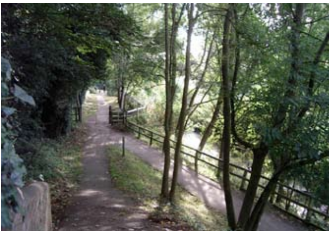
Fig 6. Drumbeg locks