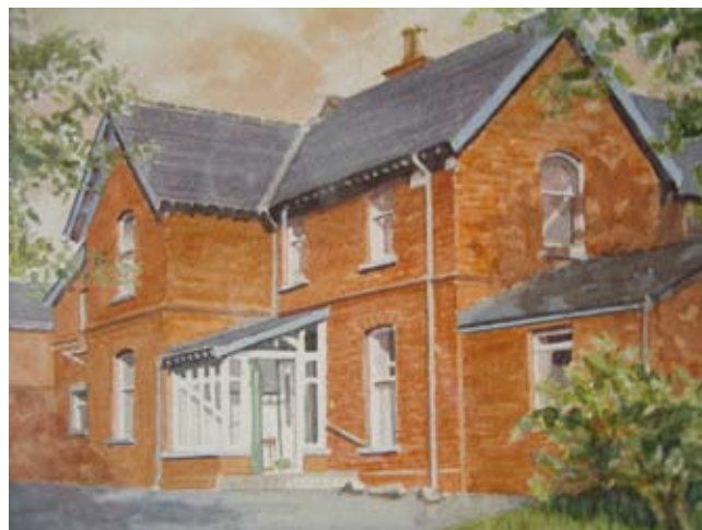
Fig 12. Dunmurry Dispensary 1890.

We have now reached the turn of the century. By now Dunmurry had its new Dispensary house built in 1890 and still the base for our surgery today.