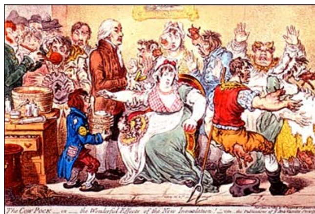
Fig 9. Gilray cartoon. "The Cow Pock"