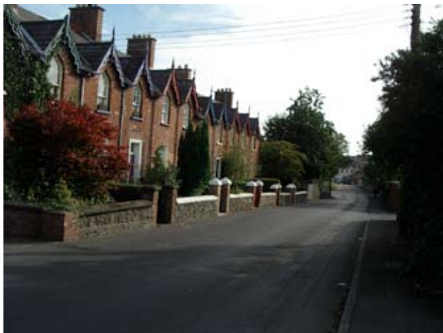
Fig 11. Hilden

also showed that typhoid, unlike typhus, was no respecter of class affecting both rich and poor alike. (Prince Albert the Prince consort died in 1861 from typhoid). William Budd between 1856 and 1860 showed that typhoid was transmitted when infected material in faeces contaminated milk, water, or the hands of those who tended the sick. In the Derriagh register Typhoid is only mentioned on one occasion as a cause of death. The minute book of the Dispensary (fig 10) however on 5 March 1888 reads –