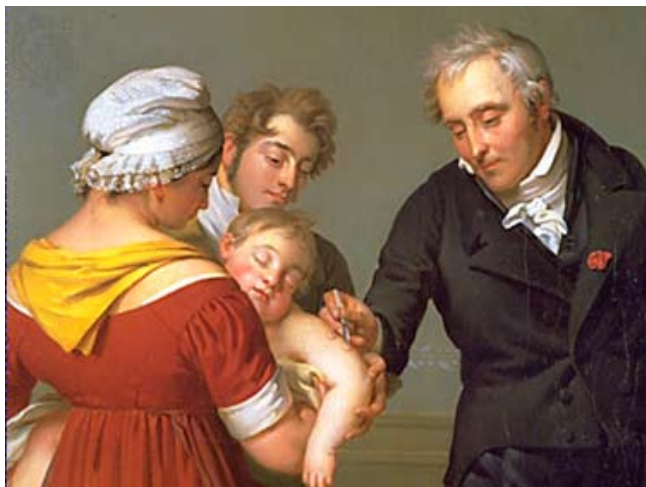
Fig 8. Vaccination

I feel this entry refers to powers originally given to the Lord Lieutenant under the Nuisances Removal and Diseases Prevention Act of 1848 (often called the Cholera Act), but now given to the Poor Law Commission. This allowed the Commission to place any part or all of the country under the authority of the Act by issuing a Cholera Order. The Guardians would then be responsible for supervising the cleaning of streets and public places, removing 'filth', burying the dead and providing medical facilities, medicines and care for persons in need.