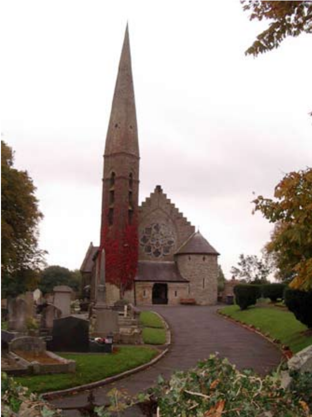
Fig 2. Derriaghy Parish Church

This led to an epidemic in 1846. Epidemic Typhus, known as “Jail fever” or “Famine fever” is louse borne and occurred when the debilitated, infested with lice, were huddled together for warmth and shelter. Those who could travel carried the infestation and infection with them (then known as “Road fever”) as they moved from poorer regions to the more affluent in search of food and employment. The Typhus epidemic started in Ireland in 1846 in the West and came to Ulster in the winter of 1846-47. In 1847 in Belfast, 1 in 5 persons was attacked by fever 6 and in Lisburn the parish priest and the Quaker owner of the Island Spinning Company died as they worked among the poor of the community. Typhus has the ability to kill large numbers of people and has a mortality, if untreated, between 10% and 60%. An outbreak in England in the 16 th Century killed 10% of the population and during Napoleon’s retreat from Moscow more soldiers died from Typhus than were killed by the Russians.