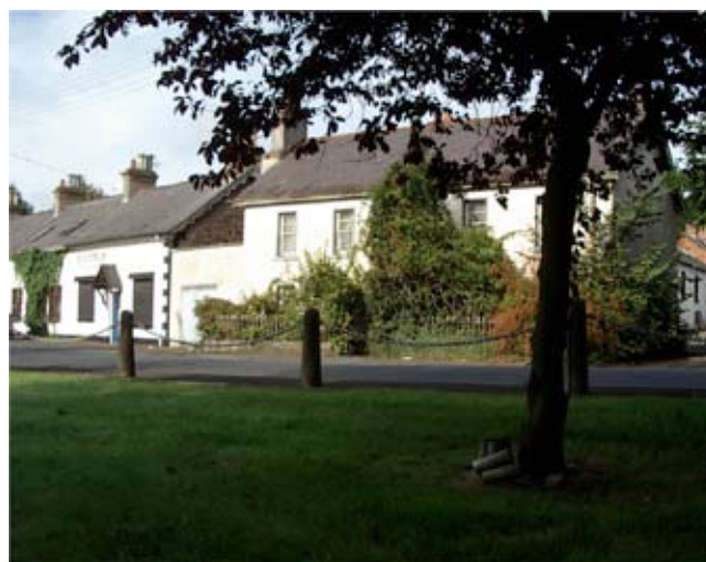
Fig 10. Lambeg Village

December 1891. Initial national results were encouraging, showing increased uptake of vaccination, but once again the number of vaccinations fell and scrutiny of returns showed a great variance in performance between Dispensaries. It was felt that linking registration of births to vaccination might improve rates and in 1864 two Acts were passed and came into effect – The Birth and Death Registration (Ireland) Act and The Compulsory Vaccination (Ireland) Act. This allowed Dispensary medical officers to become Registrars of Births and Deaths thus supplementing their income and as they were the public vaccinators the linkage was achieved. It was not however compulsory for the medical officer to become registrar. Parents would be fined 10/- for non-compliance with the Vaccination Act. These measures had the desired effect and smallpox deaths, in Ireland, which had fallen from 6000 per year in the 1830’s to 1700 per year in the 1850’s (showing some benefit from the earlier arrangements) fell to a total number of 338 cases over the four years 1867-70, of which 99 died. On further analysis of these 99 deaths 67 had occurred in a two week period in 1868 and could be directly traced to the work of a single inoculator 17 . The poor in Ireland had a preference in favour of inoculation with smallpox virus in the 1850’s and 1860’s as the inoculators were peasants themselves.