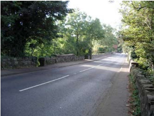
Fig 5. Drumbridge

Parliament 12 . When it eventually passed however, it excluded the fever hospitals. The infirmary surgeons, less dependent on voluntary subscription, had pressed hard to be excluded and achieved their aim.