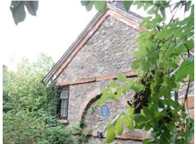
Fig 7. Drumbeg lock-keepers house