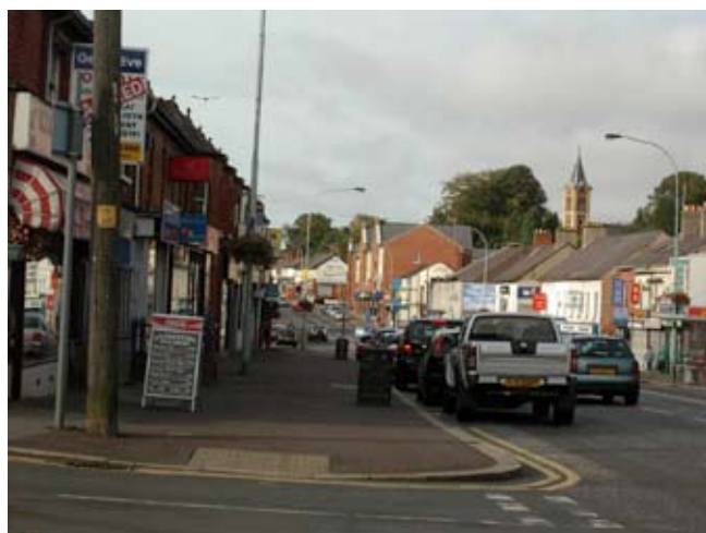
Fig 1. Dunmurry village 2007