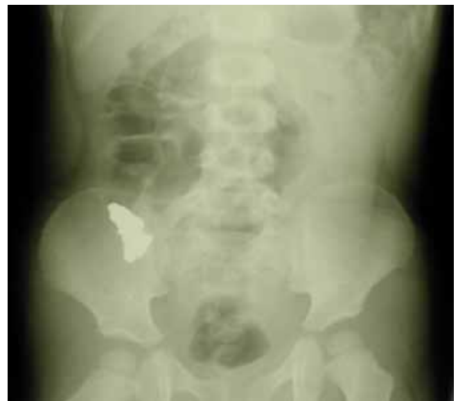
Fig 1. Abdominal X-ray: demonstrating a foreign body in the region of the ileo-caecal valve. There was no small bowel dilatation and there was air in the rectum.

(reference range 4.0 – 11.0) and an elevated C - reactive protein of 92 mg/L (reference range 0 – 10). His electrolyte profile was normal. Urinalysis showed ketones and a trace of blood.