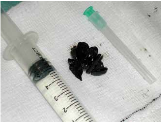
Fig 3. Foreign bodies found in the caecum and ileum, which turned out to be magnets

fistula found 5cm proximal to the ileo-caecal valve (figure 2). Foreign bodies, which after removal were found to be magnets, were found in the caecum and in the terminal ileum (figure 3).