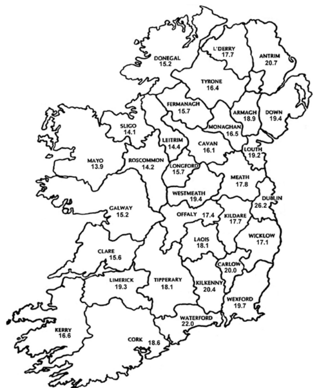
Fig 4. County death rates plotted from Grimshaw’s 1881 census data 4 . Grimshaw in the original map indicated by a line drawn from Londonderry to Cork (Skibbereen) the division of the west with little phthisis from the east with its phthisical towns.

State Medicine of the Royal Academy of Medicine in Ireland 8 . He showed that pulmonary consumption, accounting for more than one-tenth of all deaths, was the most potent cause of death during the decade 1871-1880; it accounted for 103,528 deaths out of a total of 966,745. The countrywide death rate from phthisis was 19.6 per 10,000 annually. In towns with a population of 10,000 or more, the rate rose to 34.7. In Belmullet on the Mayo coast the annual death rate per 10,000 of the population from phthisis was 4.8; in the North Dublin Union it was 33.4, and in Belfast it was 38.2. A line drawn from Londonderry to Skibbereen divided the poverty-stricken west with little phthisis from the richer east with its phthisical towns 8 . Grimshaw improved on Wilde a. by contracting the social classes into four categories, and b. by recourse to cartography. (Figure 4, greatly simplified from the author’s elaborate diagram). The four social classes in Dublin were: I. professional and independent, II. middle class III. artisan class and petty shopkeepers, and, IV. general service class 8 .