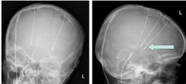
Fig 3. X-rays demonstrating the position of DBS wires

Pallidal DBS should be considered a reversible procedure, in contrast to the pallidotomy it has largely superseded. The implanted neurostimulator is often described as a brain “pace maker” (figure 3). The surgery is performed in awake adults, but in children a general anaesthetic is used.