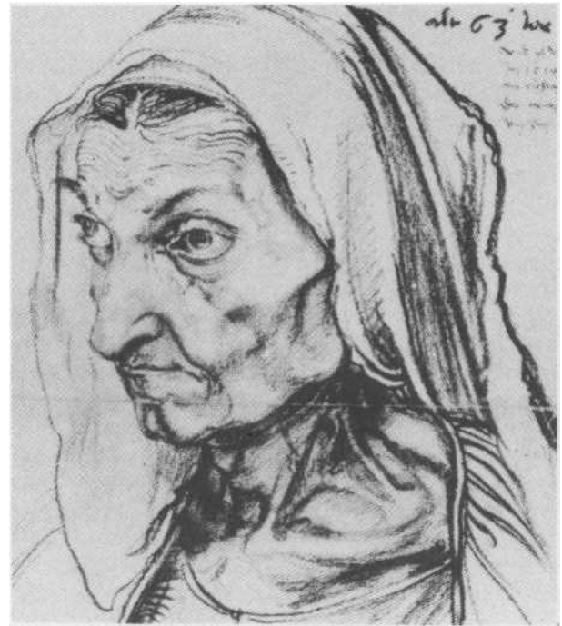
Fig. 2 The Artist's Mother (1514) by Albrecht Dürer

in 1514 shows her in late middle age, careworn and wasted, and with a divergent squint.