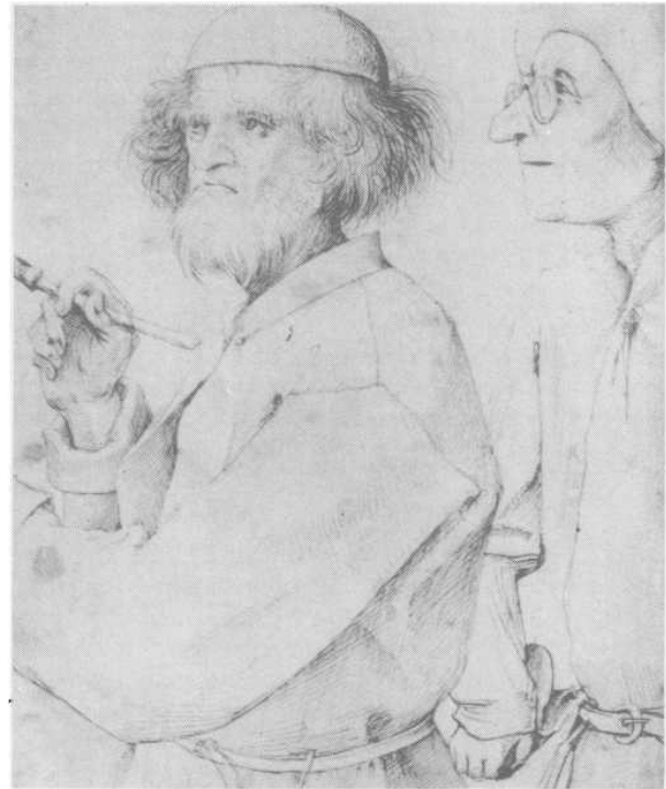
Fig. 9 The Painter and the Connoisseur (1568) by Pieter Bruegel

It is my hope that, in thus presuming to comment upon the works of great artists, whose vision, understanding and skill have given delight and