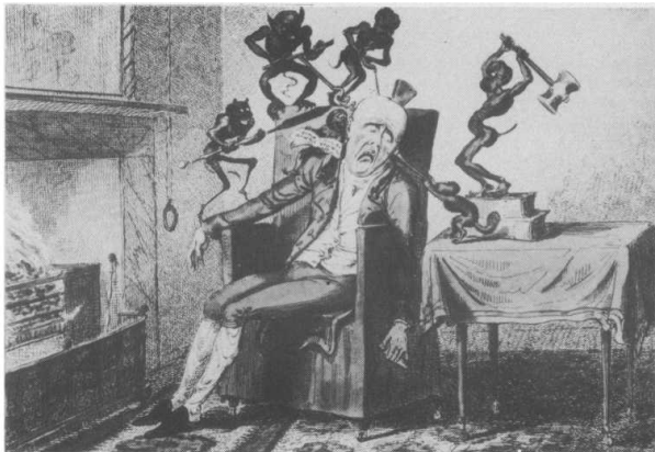
Fig. 6. The Headache (1819) by George Cruikshank

The Headache (1819) (Fig. 6) by George Cruikshank (1792-1878), Gillray's successor as political cartoonist, is so dramatically conceived that it too may have been based on his own knowledge of such an event.