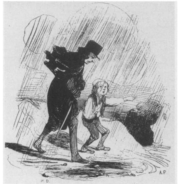
Fig. 8 The Country Doctor (1840) by Honoré-Victorin Daumier

Daumier's fellow countryman, who revolutionised the art of disguise by inventing new costumes for balls, carnivals and entertainments of all kinds, created in his drawings real men and women with their little habits, tricks and absurdities, their sensibilities, appetites and hypocrisy. Taken from the series 'The Vexations of Happiness', Colic On His Wedding Night (1838) must surely be one of the most ludicrous descents from the emotionally sublime to the ridiculous.