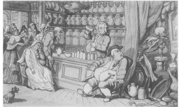
Fig. 3 The Apothecary and His Assistant at Work (1814) by Thomas Rowlandson

man's misery. Regrettably, the future looks even more bleak for the waiting queue of patients in The Apothecary and His Assistant at Work (1814) (Fig. 3).