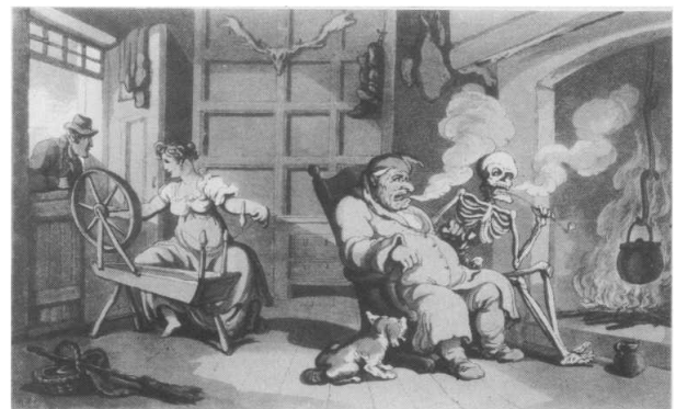
Fig. 4 Another Whiff and All Is O'er, Gaffer Goodman Is No Afore (1815) by Thomas Rowlandson

In those days the benefits of a second opinion were sometimes illusory as in When Doctors Three the Labour Share, No Wonder Death Attends Them There (1816). And at that time, Rowlandson, an astute observer of social customs and their consequences, could see for himself the lethal effects of heavy smoking which he vividly illustrated in Another Whiff and All Is O'er, Gaffer Goodman Is No More (1815) (Fig. 4).