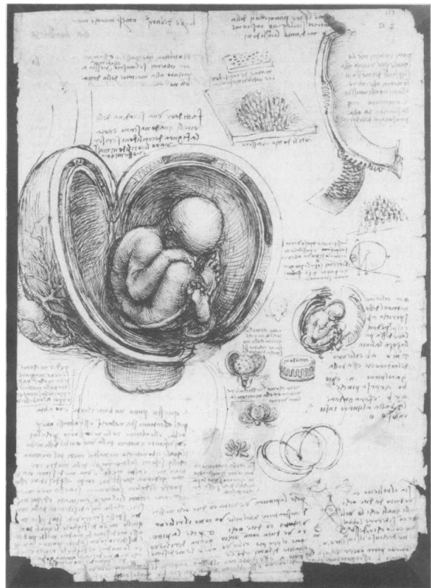
Fig. 1 The Infant in the Womb (1510-12) by Leonardo da Vinci