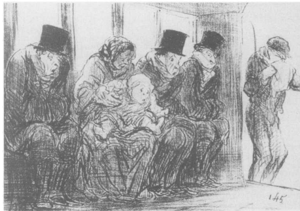
Fig. 7 An Omnibus During An Epidemie of Grippe (1858) by Honoré-Victorin Daumier

The attitudes and expressions of the passengers