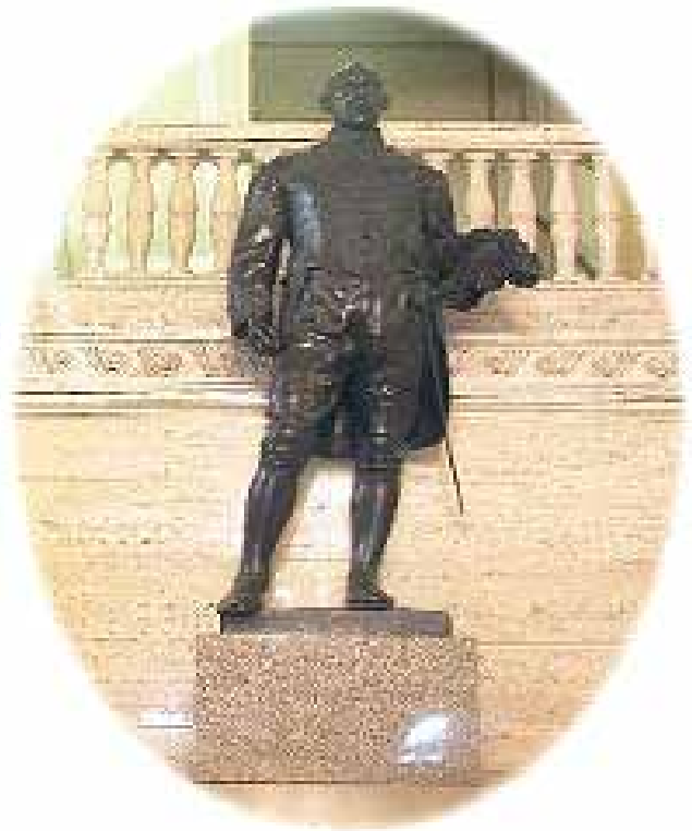
Fig 4. Statue of Sir James Craig in the Hall of Parliament Buildings, Stormont

As among people, however, among nations and governments there are slow learners, and the ViceRegal Commission on