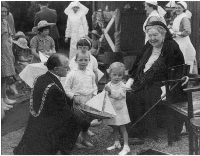
Fig 2. Lady Aberdeen Photographed with Alfie Byrne, perennial Lord Mayor of Dublin, at Peamount Sanatorium in 1937

It was during 1886 that the Irish Industries Association attempted to set up cottage and village industries. The restoration of Irish industry was the theme of the Irish International Industrial Exhibition opened on 12 October 1907, the first year of the return of the Aberdeens to Ireland. A City and Town Planning Exhibition opened at the Linenhall Barracks on 15 July 1914, featuring a planning competition for Dublin.