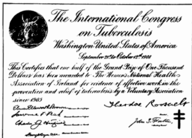
Fig 3. Certificate of Grand International Prize shared with New York Association in 1908

councils then contracted beds in these and other institutions in preference to building their own. Such a penurious / skinflint approach is explicable in light of the fact that a ViceRegal Commission was established in May 1903 to find ways of reducing cost to taxpayers of supporting the sick and indigent poor - The Report was given to Lord Aberdeen in 1906. The sanatorium at Peamount, Newcastle, Co Dublin was built and opened despite considerable local opposition - on 21 July 1912, the eve of its opening, men from nearby towns and villages demolished one of the pavilions. (p 168) 23