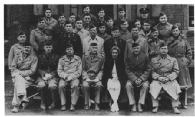
Fig 1. The Fifth General Hospital in Belfast, 1942 4

The U.S. Army 5 th General Hospital 1,2 was activated on 3 January 1942 at Fort Bragg, North Carolina 3 weeks after Germany declared war on the United States. Five hundred patient beds were to be sited at “Musgrave Park in the environs of Belfast”. The former boys’ reformatory was occupied at that time by the 31 st General Hospital of the British Army.